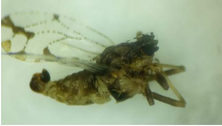
Fig.1: Phacopteron lentiginosum