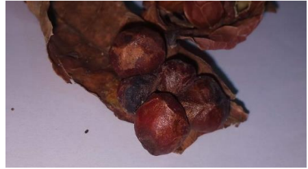
Fig.2: Galls on Garuga pinnata