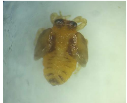
Fig.4: Immature of Phacopteron