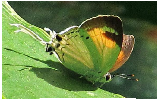
Fig.2: Suasa lisodes