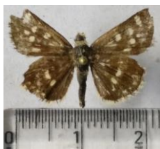
Fig.1: Spialia zebra upperside