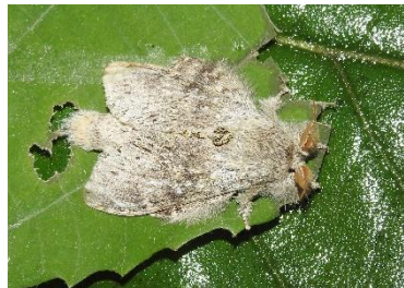
Fig.8: Freshly eclosed Lobster Moth