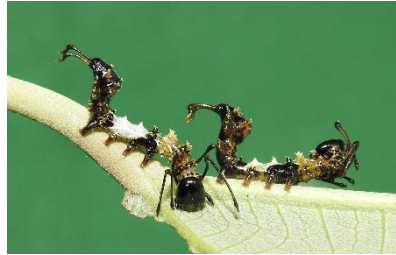
Fig.2: Lobster Moth caterpillar