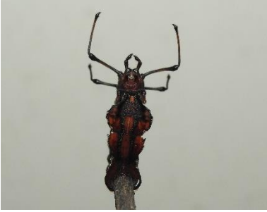
Fig.5: Lobster Moth Caterpillar