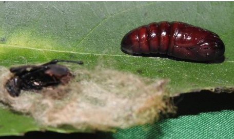
Fig.7: Lobster Moth pupa