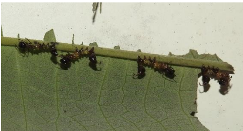
Fig.3: Lobster Moth Caterpillar