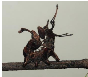
Fig.4: Lobster Moth Caterpillar