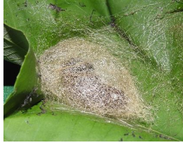
Fig.6: Lobster Moth cocoon