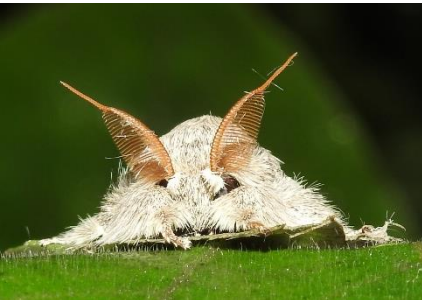
Fig.9: Freshly eclosed Lobster Moth