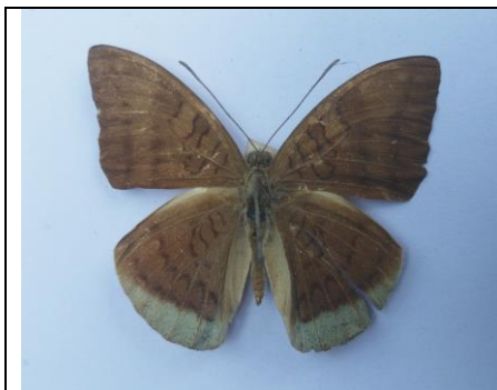
Figure 1. Common Earl, Sattal 1.v.1963

Varshney, R.K. & P. Smetacek (eds.) 2015. A Synoptic Catalogue on the Butterflies of India . Butterfly Research Centre, Bhimtal and Indinov Publishing, New Delhi, ii + 261 pp., 8 pl.