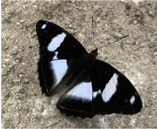
Fig.2: Athyma punctata at Anini, Dibang valley, Arunachal Pradesh, India