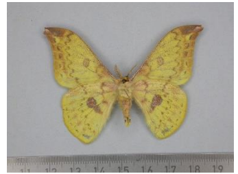
Fig.6: Lemaireia luteopeplus , male, India, Mizoram, ventral view