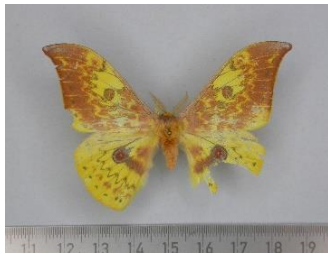
Fig.1: Lemaireia himalayana n. sp., male holotype, India, Arunachal Pradesh, dorsal view

Sondhi, S., T. Karmakar, Y. Sondhi & K. Kunte. 2021. Moths of Tale Wildlife Sanctuary, Arunachal Pradesh, India with seventeen additions to the moth fauna of India (Lepidoptera: Heterocera). Tropical Lepidoptera Research 31 (Supplement 2): 1–53. DOI: 10.5281/zenodo.5062572.