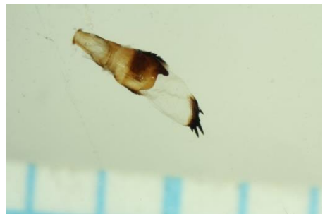
Fig.11 Lemaireia himalayana n. sp., same genitalia as in Fig. 4, Aedeagus.