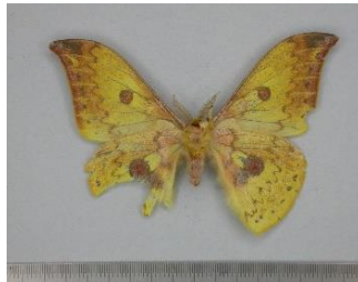
Fig.2: Lemaireia himalayana n. sp., male holotype, India, Arunachal Pradesh, ventral view