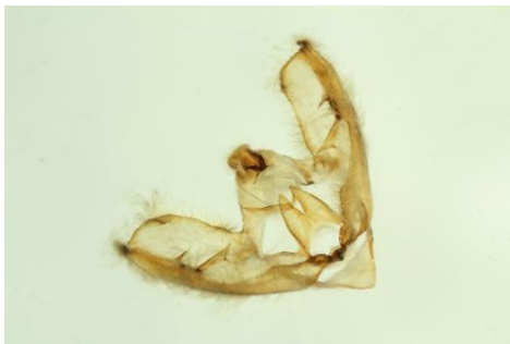
Fig.10: Lemaireia himalayana n. sp., same genitalia as in Fig. 4, posterier view.