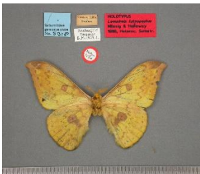
Fig.4: Lemaireia luteopeplus , male holotype, India, Meghalaya, Khasi Hills, ventral view, NHM