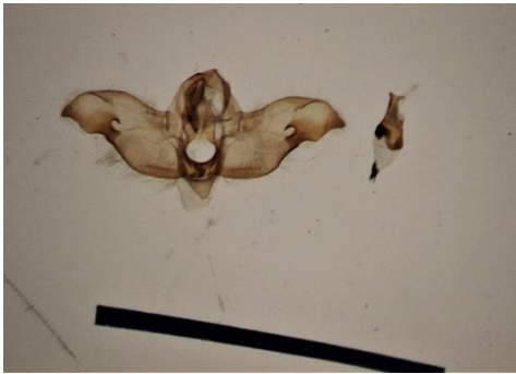
Fig.8: Lemaireia luteopeplus , India, Mizoram, male genitalia prep. No. 2601/19 Naumann.