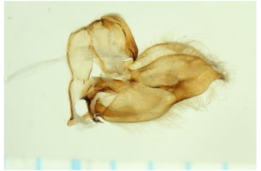
Fig.9: Lemaireia himalayana n. sp., same genitalia as in Fig. 4, lateral view.