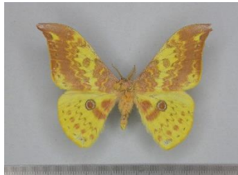
Fig.5: Lemaireia luteopeplus , male, India, Mizoram, dorsal view