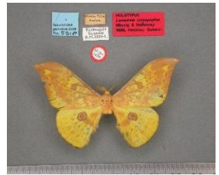
Fig.3: Lemaireia luteopeplus , male holotype, India, Meghalaya, Khasi Hills, dorsal view, NHM