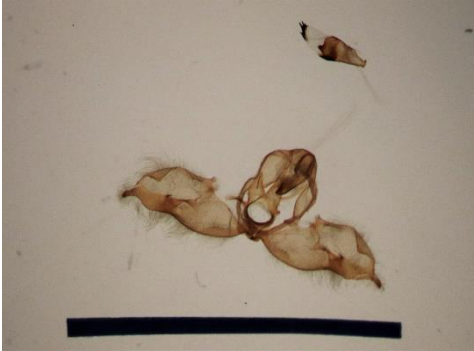
Fig.7: Lemaireia himalayana n. sp., holotype, male genitalia prep. no. 2600/19 Naumann