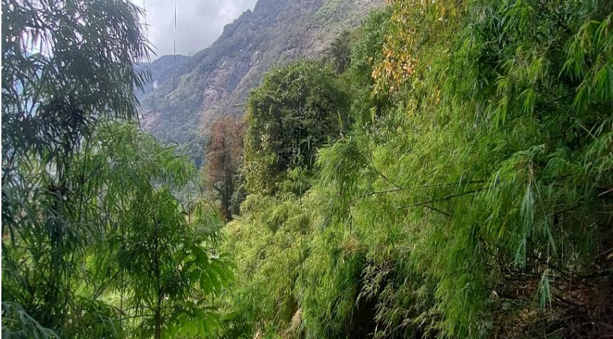
Figure 2. Dark forester, Lethe brisanda sighted in Tholung Valley, Dzongu, Mangan district.