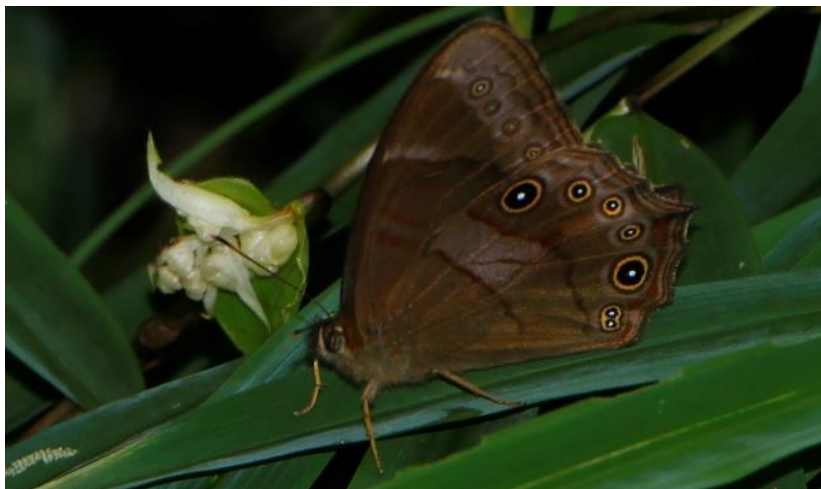
Figure 2. Dark forester, Lethe brisanda sighted in Tholung Valley, Dzongu, Mangan district.