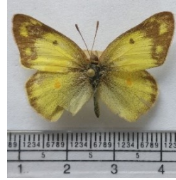
Fig.15: Colias nilagirensis