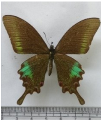
Fig.4: Papilio bianor