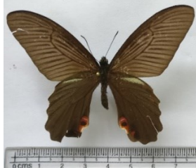
Fig.5: Papilio protenor