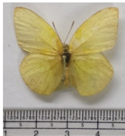
Fig.11: Catopsilia pomona