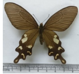
Fig.3: Byasa dasarada