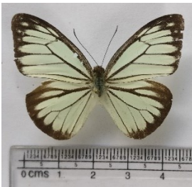
Fig.22: Pareronia hippia