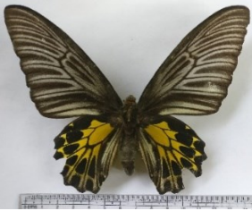
Fig.1: Triodes aeacus