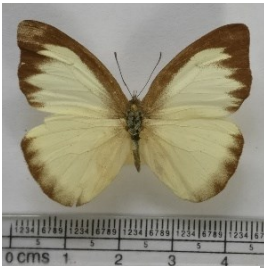
Fig.16: Appias lycida