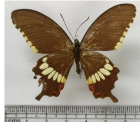
Fig.6: Papilio polytes