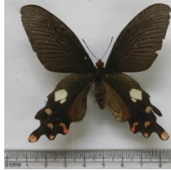
Fig.2: Byasa polyeuctes