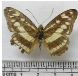
Fig.23: Athyma opalina