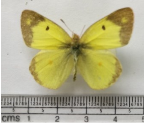
Fig.13: Colias erate