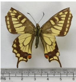
Fig.10: Papilio machaon