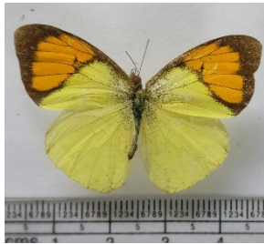
Fig.17: Ixias pyrene