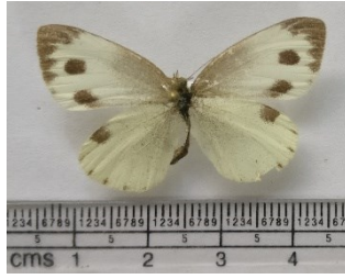
Fig.14: Pieris canidia