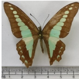
Fig.8: Graphium sarpedon