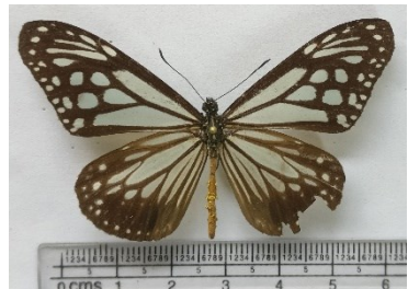
Fig.24: Parantica melaneus