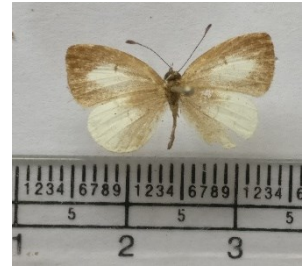
Fig.21: Neopithecops zalmora