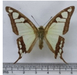
Fig.9: Grahium cloanthus