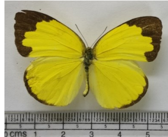
Fig.12: Eurema hecabe