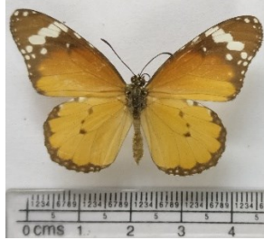
Fig.20: Danaus chrysippus