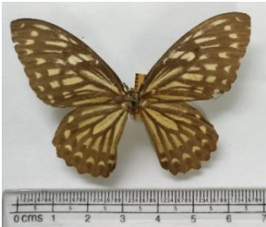
Fig.7: Papilio clytia