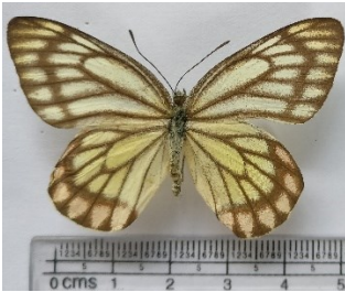
Fig.19: Delias eucaris