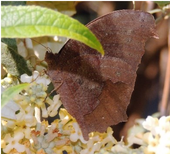
Fig.7. Melanitis phedima