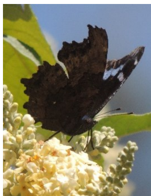
Fig.2. Kaniska canace