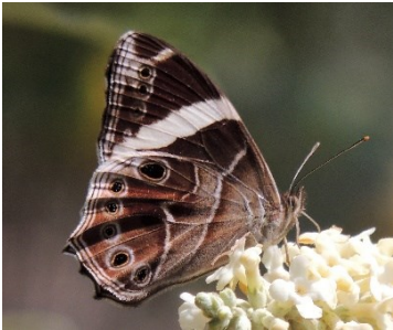
Fig.5. Letho confusa