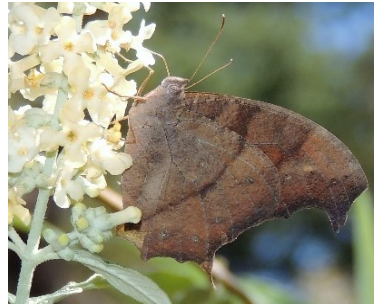
Fig.6. Melanitis leda