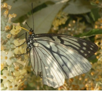
Fig.3. Hestina persimilis female