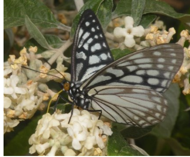
Fig.4. Hestina persimilis male