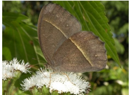
Fig.8. Mycalesis mineus