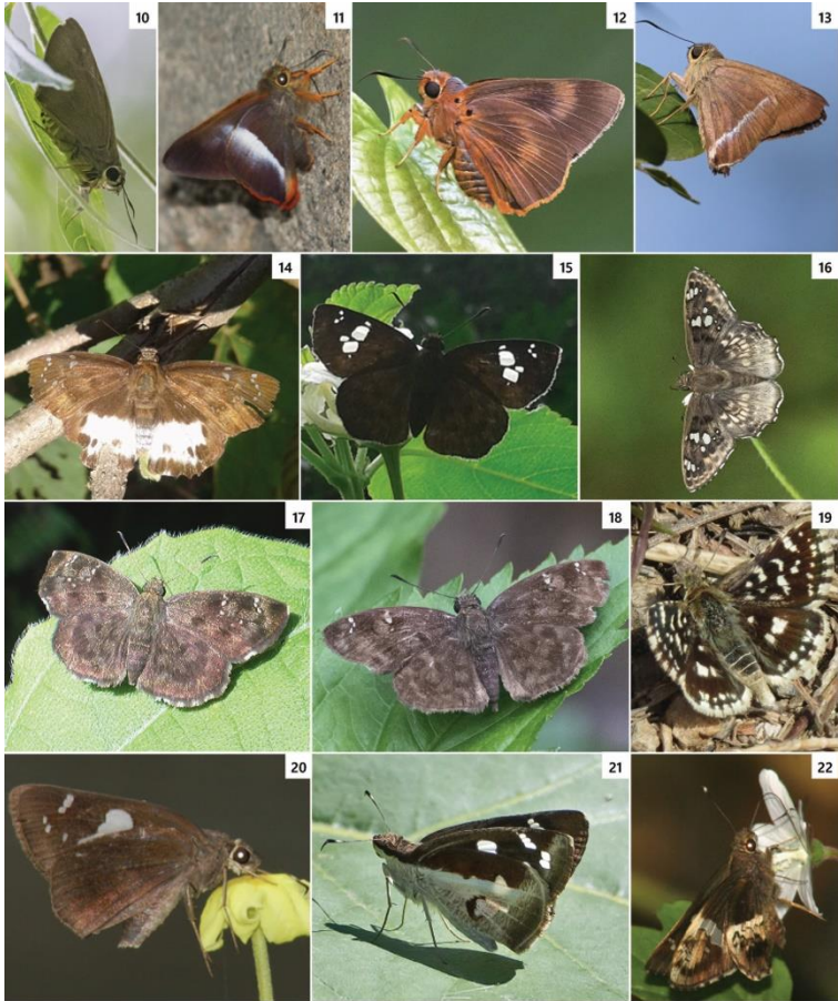
10. Badamia exclamatonis 11. Bibasis sena 12. Burara oedipodea 13. Hasara chromus 14. Tagiades menaka 15. Pseudocoladenia dan 16. Caprona sp. 17-18. Sarangesa dasahara 19. Spialia galba 20. Notocrypta curvifascia 21. Udaspes folus 22. Hyarotis adrastus