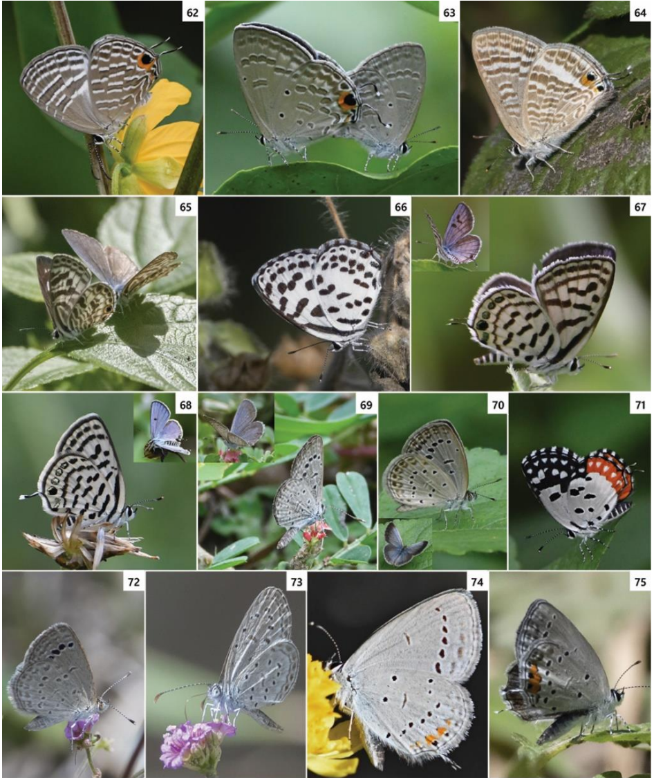
62. Jamides celeno 63. Catochrysops strabo 64. Lampides boeticus 65. Leptotes plinius 66. Castalius rosimon 67. Tarucus balkanicus 68. Tarucus nara 69. Zizeeria karsandra 70. Pseudozizeeria maha 71. Talicauda nyseus 72. Zizina otis 73. Zizula hylax 74. Everes argiades 75. Everes hugelii