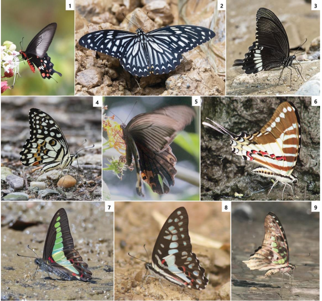
1. Pachliopta aristolochiae 2. Papilio clytia 3. Papilio polytes 4. Papilio demoleus 5. Papilio protenor 6. Graphium nomius 7. Graphium sarpedon 8. Graphium doson 9. Graphium agamemnon