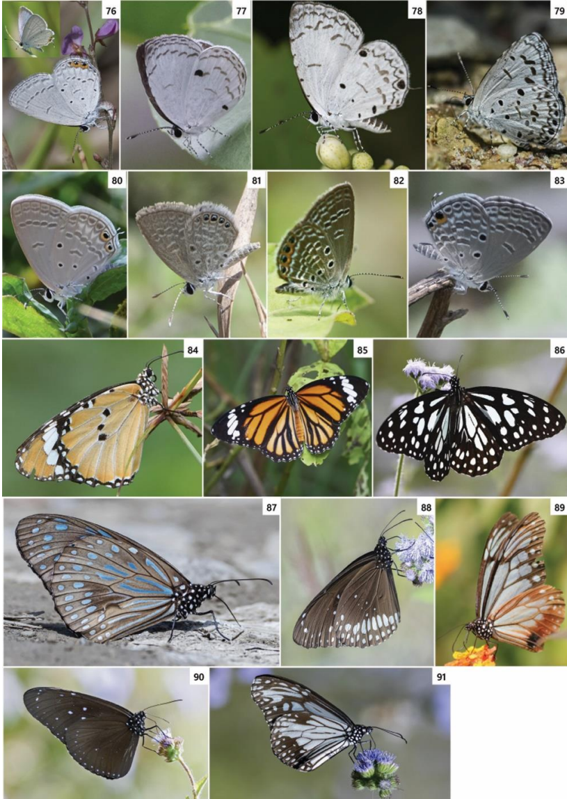
76. Everes lacturnus 77. Neopithecops zalmora 78. Megisba Malaya 79. Acytolepis puspa 80. Euchrysops cnejus 81. Freyeria putli 82. Freyeria trochylus 83. Chilades pandava 84. Danaus chrysippus 85. Danaus genutia 86. Tirumala limniace 87. Tirumala septentrionis 88. Euploea core 89. Parantica sita 90. Euploea mulciber 91. Parantica aglea