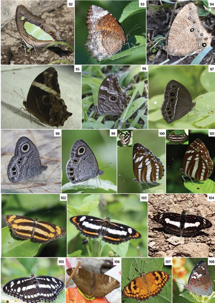
92. Polyura athamas 93. Elymnias hypermnestra 94. Melanitis leda 95. Lethe europa 96. Lethe rohria 97. Myscalesis sp. 98. Ypthima baldus 99. Ypthima huebneri 100. Neptis hylas 101. Neptis Sappho 102. Pantoporia sp. 103. Athyma neste 104. Athyma selenophora 105. Athyma pertus 106. Euthalia aconthea 107. Symphaedra nais 108. Euthalia lubentina