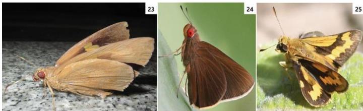
23. Erionota torus 24. Matapa aria 25. Potanthus sp.