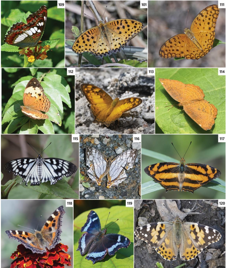
109. Moduza procris 101. Argynnis hyperbius 111. Phalanta phalantha 112. Cupha erymanthis 113. Vagrans egista 114. Ariadne meritone 115. Euripus consimilis 116. Cyrestis thyodamas 117. Symbrenthia lilaea 118. Aglaia caschmirensis 119. Kaniska canace 120. Vanessa cardui