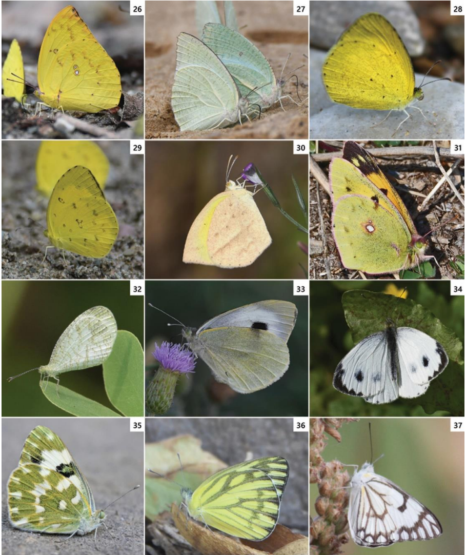
26. Catopsilia pomona 27. Catopsilia pyranthe 28. Eurema brigitta 29. Eurema hecabe 30. Eurema laeta 31. Colias fieldii 32. Leptosia nina 33. Pieris brassicae 34. Pieris canidia 35. Pontia daplidice 36. Cepora nerissa 37. Belenois aurota