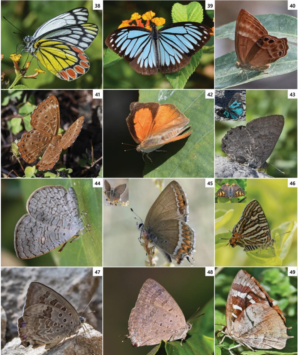
38. Delias eucharis 39. Pareronia hippia 40. Abisara bifasciata 41. Zemeros flegyas 42. Curetis acuta 43. Poritia hewitsoni 44. Spalgis epius 45. Heliophorus sena 46. Spindasis vulcanus 47. Arhopala amantes 48. Arhopala atrax 49. Flos adriana