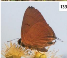
121. Vanessa indica 122. Junonia almana 123. Junonia atlites 124. Junonia hierta 125. Junonia iphita 126. Junonia lemonias 127. Junonia orithya 128. Hypolimnas bolina 129. Kallima inachus 130. Acraea terpsicore 131. Acraea issoria 132. Libythea myrrha 133. Rapala pheretima