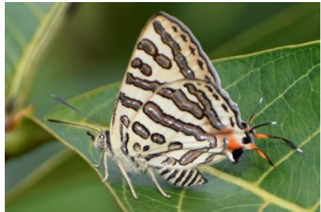
Fig.4: Spindasis ictis underside