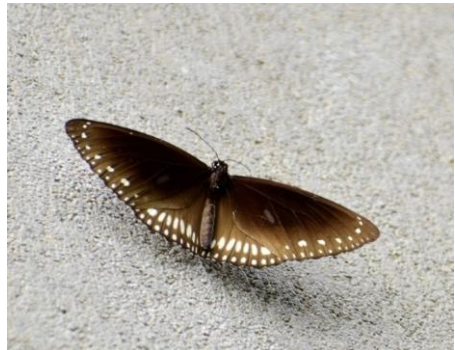
Fig.6: Euploea klugii upperside