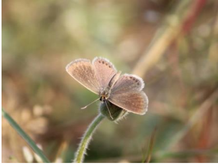
Fig.1: Freyeria putli upperside