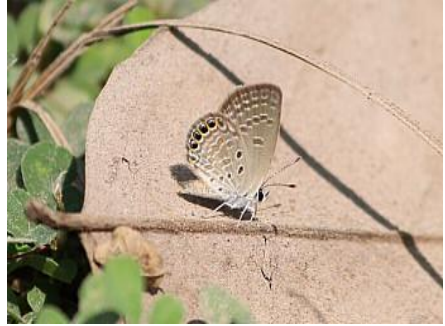
Fig.2: Freyeria putli underside