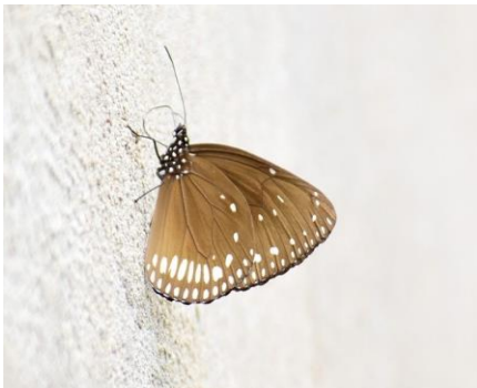
Fig.5: Euploea klugii underside