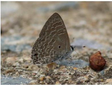
Fig.3: Anthene lycaenina