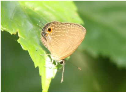
Fig. 1: Jamides bochus underside

# New record added to the butterflies of the state Chhattisgarh in the present study.