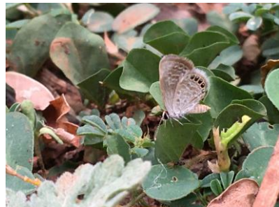
Fig.10: Freyeria putli