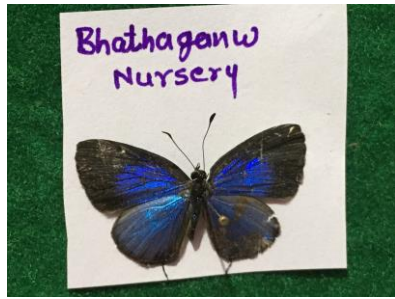
Fig. 2: Jamides bochus upperside