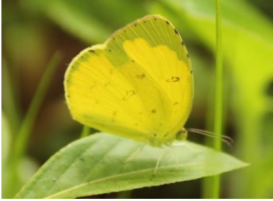
Fig.5: Eurema hecabe