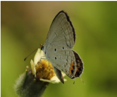
Fig.7: Everes lacturnus