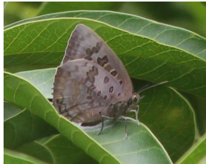
Fig.8: Arhopala amantes