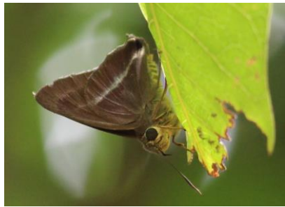
Fig.4: Hasora chromus