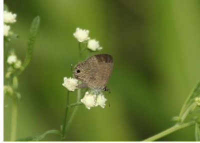
Fig.6: Prosotas nora