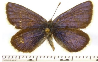
Fig.5: Albulina pharis , Fawcett's Mountain Blue, ♂ UP