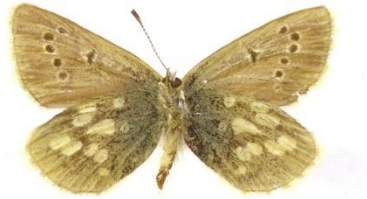
Fig.6: Albulina pharis , Fawcett's Mountain Blue, ♂ UN