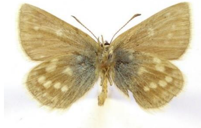
Fig.2: Albulina arcaseia , Kamba Mountain Blue, UN