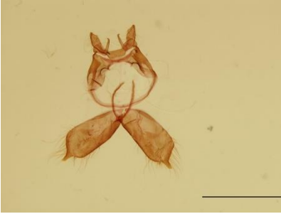
Fig.3: Albulina arcaseia , genitalia capsula