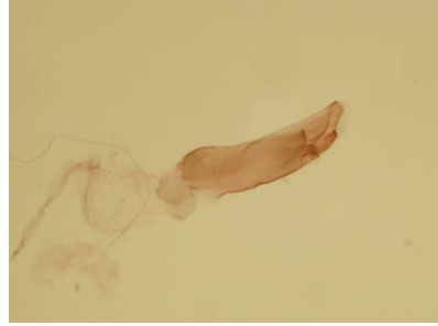
Fig.4: Albulina arcaseia , aedaegus