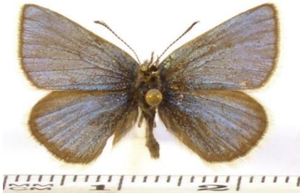
Fig.1: Albulina arcaseia , Kamba Mountain Blue, UP

DOI:10.1111.j.1096-0031.2012.00421.x Varshney, R.K. & P. Smetacek (eds.). 2015. A Synoptic Catalogue of Butterflies of India. Butterfly Research Centre, Bhimtal & Indinor Publishing, New Delhi, ii + 261 pp., 8 pls.