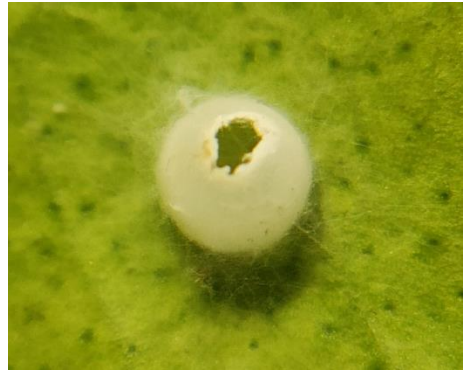
Fig.9 & 10: Parasitized Blue Mormon Egg