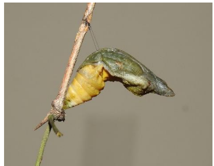
Fig.8: Parasitized Pupa