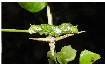
Fig. 2: Bird excreta mimicking stage of caterpillar