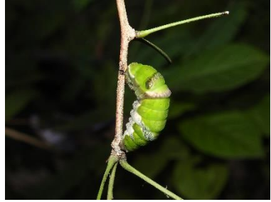
Fig.4: Caterpillar ready for pupation