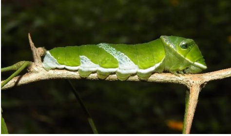
Fig.3: Caterpillar final instar