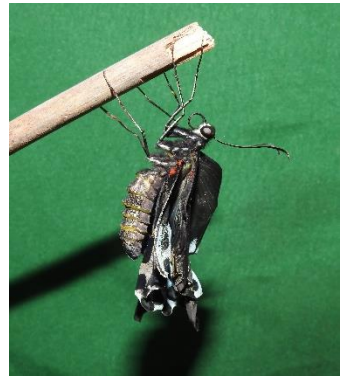
Fig.6: Freshly eclosed, deformed Blue Mormon