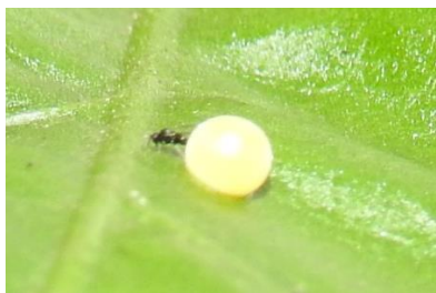
Fig. 1: Parasitoid wasp on Blue Mormon Egg on Bel leaf