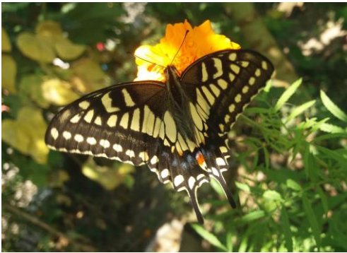
Fig.1: P. machaon 230m in Rapti, Chitwan, 1 st November, 2020

Varshney, R.K. & P. Smetacek. 2015. A Synoptic Catalogue of the Butterflies of India . Butterfly Research Centre, Bhimtal and Indinov Publishing, New Delhi, ii + 261 pp. +8 pls.