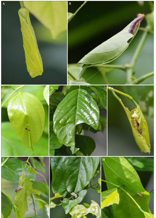
Fig. 2: Shelter architectures