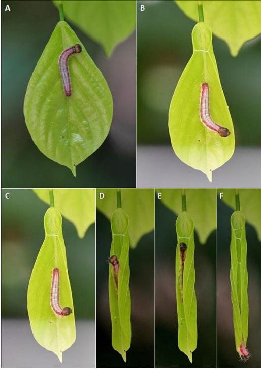
Fig. 4: Shelter making