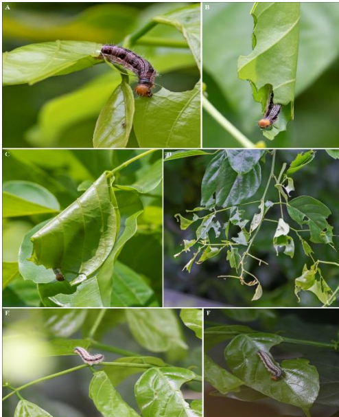
Fig. 3: Feeding