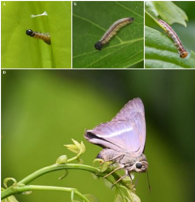
Fig. 1: Larval stages